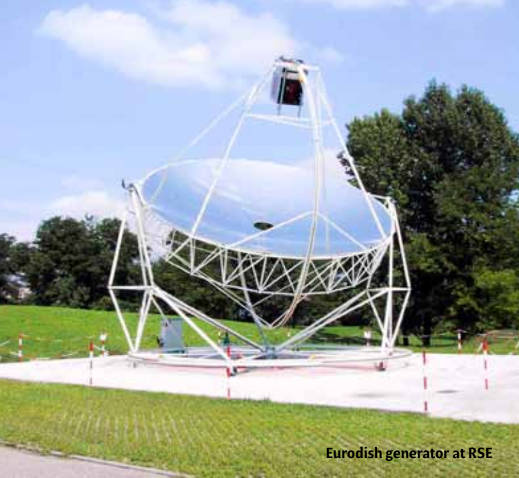
Eurodish generator at RSE