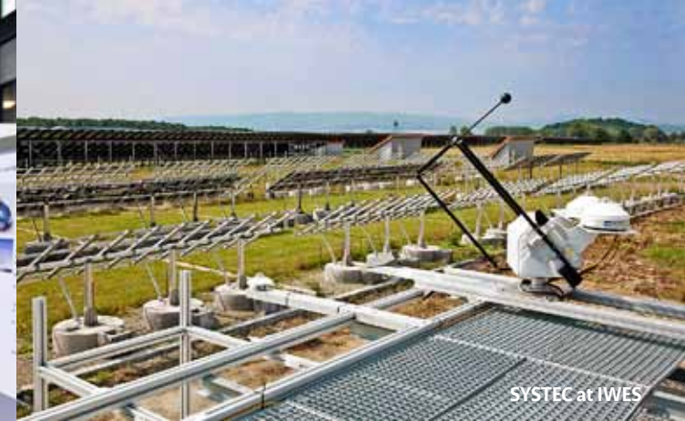
SYSTEC at IWES