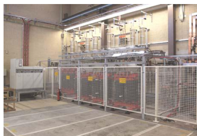
KEMA Flex Power Grid Laboratory

Thanks to the rapid development and significant cost reduction of power electronics in the recent years, DER inverters have been growing significantly in capacity as well as in functionality. However, testing infrastructures are in many cases still lacking capacity and capabilities to fully assess the performance and function of the devices. To overcome this gap, a comprehensive inventory has been made, including all facilities available in the DERRi network.