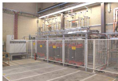
KEMA Flex Power Grid Laboratory

Thanks to the rapid development and significant cost reduction of power electronics in the recent years, DER inverters have been growing significantly in capacity as well as in functionality. However, testing infrastructures are in many cases still lacking capacity and capabilities to fully assess the performance and function of the devices. To overcome this gap, a comprehensive inventory has been made, including all facilities available in the DERRi network.